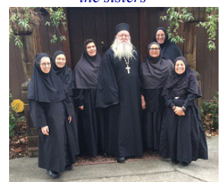
Is it okay to say "Cheese!" on a fast day?