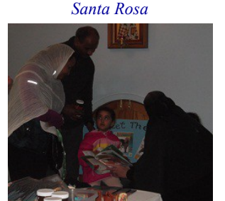
Hey, Mom and Dad. Want to hear a story?