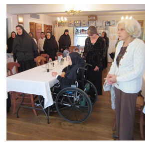
We give thanks to Thee, O Christ our God

Members of St. John the Baptist Church, Orinda, CA and St. Nicholas Church, San Francisco, CA joined us for Liturgy and a short talk on November 21 for the Feast of the Entrance of the Theotokos into the Temple.