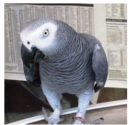
Sunrise a newsworthy bird!

We had been contemplating finding a companion for Petie, when we heard of another African Grey, named Sunrise, in need of a new home. So, since early August, Sunrise has been ensconced in his own cage just outside of Petie's aviary, and he's an absolute joy. He is amusingly talkative, handsome and gentle. Of course, we have all fallen in love with him. Perhaps, though, it is more accurate to say ALL BUT PETIE, who is a tad jealous. However, we have been giving Petie plenty of attention, and he is slowly beginning to think perhaps it's okay to have another bird around. It will be a few weeks before we try the grand experiment and put them together. Stay tuned!