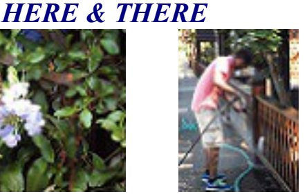
Power-washing the fence -Can we use this to clean the kitchen?"