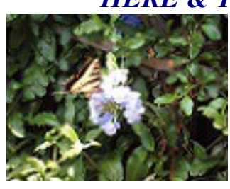
Butterfly on foliage -Hmm, what shall I eat today?